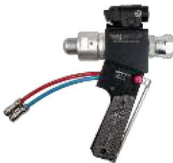
IB15GA01 40 PRO Blast Gun