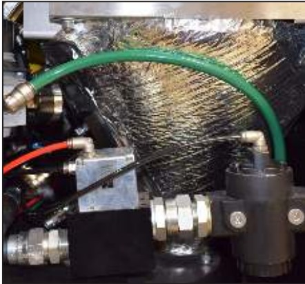
Left Side: Air Valves/Pneumatic Signal Lines

Panels on each side of the machine are easily removable to provide access to the air chamber and other internal parts (see photos below). Simply turn the two locking screws on each side to open the panels.