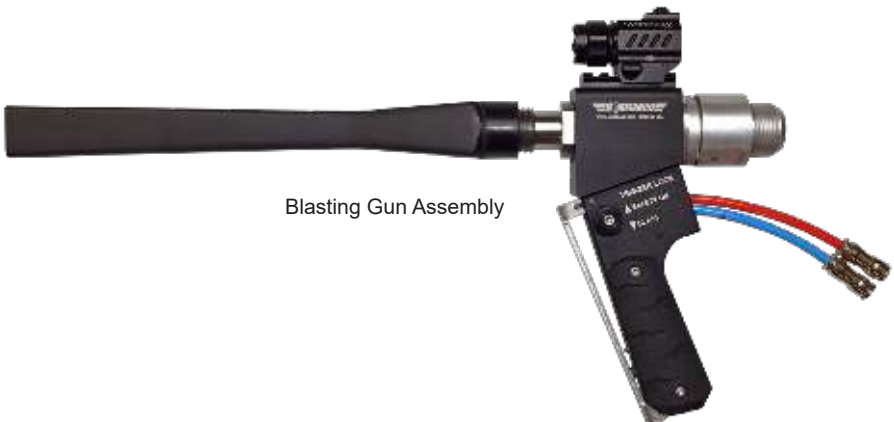
Blasting Gun Assembly