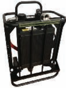
CA-500 Command Air® 500 Portable Aftercooler/Air Dryer