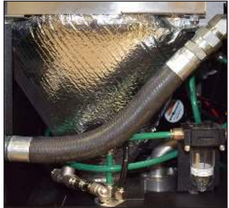
Right Side: Motor/Air Chamber & Plumbing