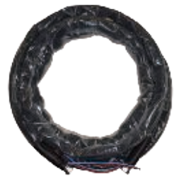
IB10GH1025-AP (40 Model) IB10GH1025-PRO (40 PRO) Replacement Blasting Hose 25 ft (7.6m), 50-250 PSI