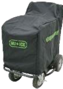
IB1MC03 Storage Cover (included with new machine)